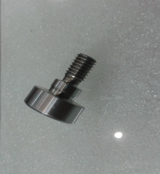
CNC TURNED COMPONENTS